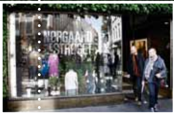
TTY Strange – CopenhagenMediaCenter.com