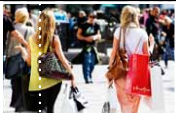
Talia Hjerno – CopenhagenMediaCenter.com